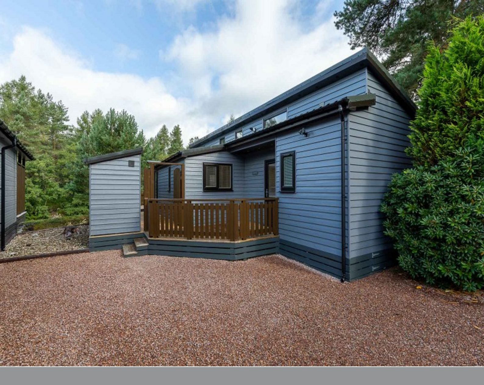
Cap Ferrat, River Tilt Park, Bridge of Tilt, Pitlochry, PH18 5TE Offers In Region Of £235,000